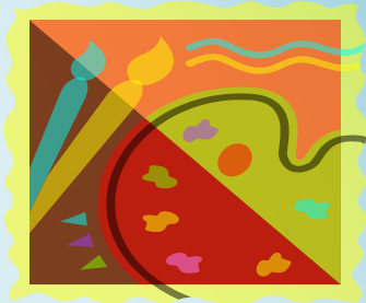
PAINTING THE TOWN

Jim Feig - beginning and advanced digital photography. Call Jim at 576- 0578 for more information