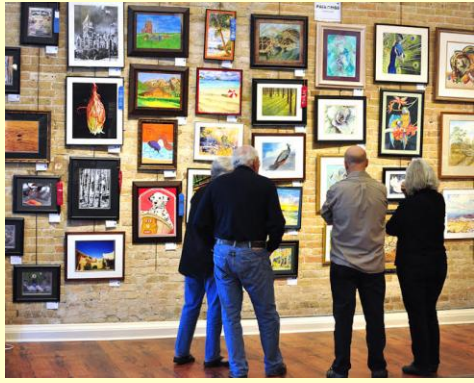
Guests enjoying the show