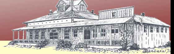
Farmer's Co-op - C. L. Thurmond Building