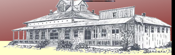
Farmer's Co-op - C. L. Thurmond Building